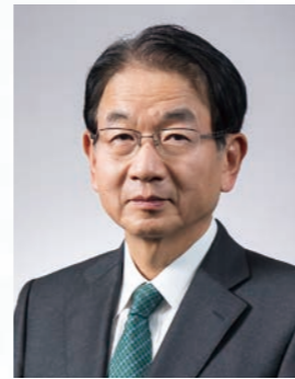
Representative Director, Chairman, President & CEO

We will update you on our progress as we meet new challenges.