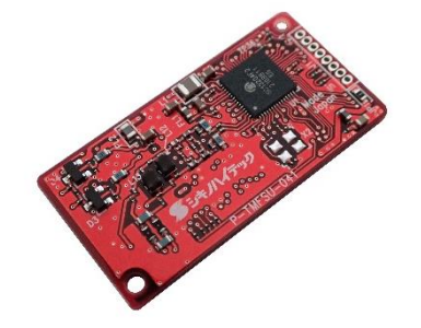
P-TMFSU-041 with SC1320A (View Larger Image)

Shikino High-Tech has been developing, manufacturing, and delivering PLC module products for IoT communications used in embedded devices. Equipped with the SC1320A, the new P-TMFSU-041 communication module complies with the HD-PLC4 standard and achieves high-speed data communication using existing power lines. By using existing power lines, it enables to build a wired network without installing new communication cables.